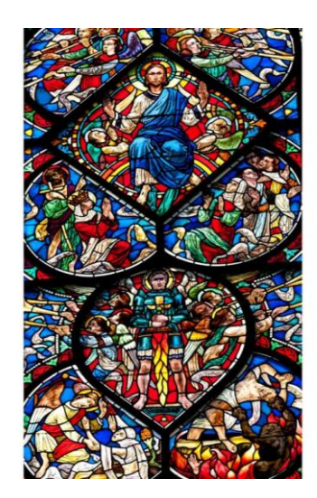
Figure 1. Gold nanoparticles are responsible for the red tint in stained glass windows and pieces of art.

A nanoparticle (NP) is defined as a particle with at least one dimension between 1 and 100 nm in size. Metallic NPs have become abundant in scientific research because they exhibit interesting and tuneable physical, optical, and chemical properties when compared with their bulk metal counterparts. This is true of gold NPs (AuNPs) in particular, which have optical properties that are easily manipulated and related to their physical state and chemical environment.<sup>1</sup> This means that they can be precisely engineered for a wide range of different applications. The use of AuNPs predates the scientific revolution, with the earliest known use being in the stained glass of the Lycurgus cup, thought to be preserved from the fourth century, A.D.<sup>2</sup> They have also been used frequently in stained glass windows, Figure 1. It is understood that gold particles dispersed in the glass are the cause of the deep red colour observable when light is shone through it.